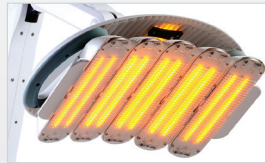
830 nm with 590 nm photosequencing

With three available treatment heads, there is one that is right for your treatment needs. Ask your physician which Healite II wavelength is right for you.