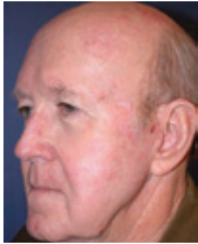
After 2 treatments