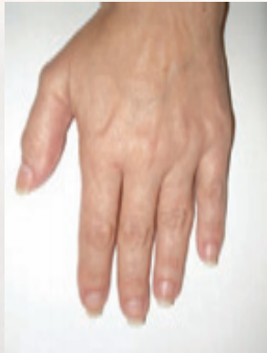
Untreated right hand